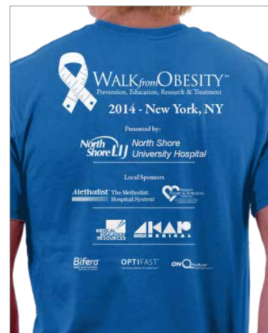
Back of T-shirt Example

Presenting Sponsors. Together the Presenting Sponsor and the ASMBS Foundation will bring this important event to your community. Countless hours and lots of hard work from local volunteers will help to present this educational and awareness event, while raising funds for obesity research, education, prevention, and treatment.