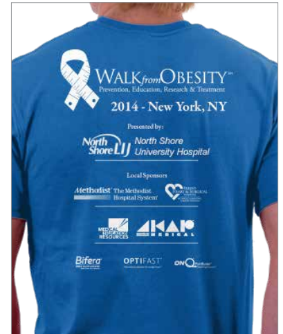
Back of T-shirt Example

Presenting Sponsors. Together the Presenting Sponsor and the ASMBS Foundation will bring this important event to your community. Countless hours and lots of hard work from local volunteers will help to present this educational and awareness event, while raising funds for obesity research, education, prevention, and treatment.