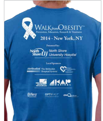
Back of T-shirt Example

Presenting Sponsors. Together the Presenting Sponsor and the ASMBS Foundation will bring this important event to your community. Countless hours and lots of hard work from local volunteers will help to present this educational and awareness event, while raising funds for obesity research, education, prevention, and treatment.